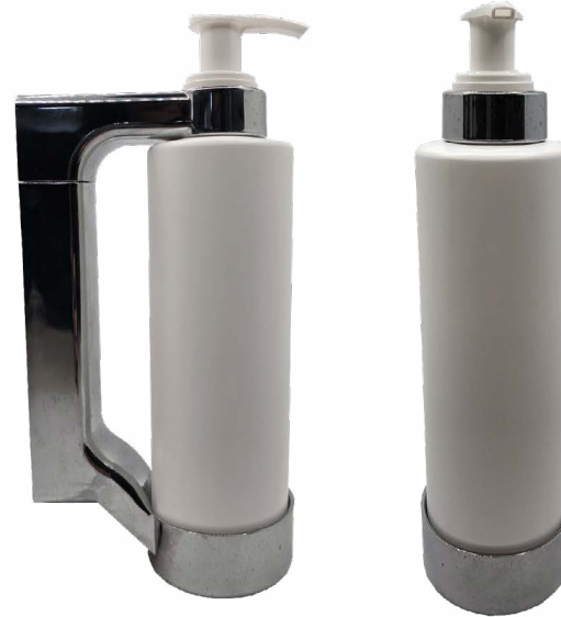
PLASTIC CHROME WALL BRACKET with release key