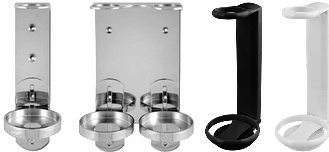
STEEL WALL BRACKET