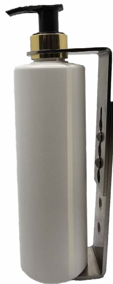
STEEL WALL BRACKET without release key